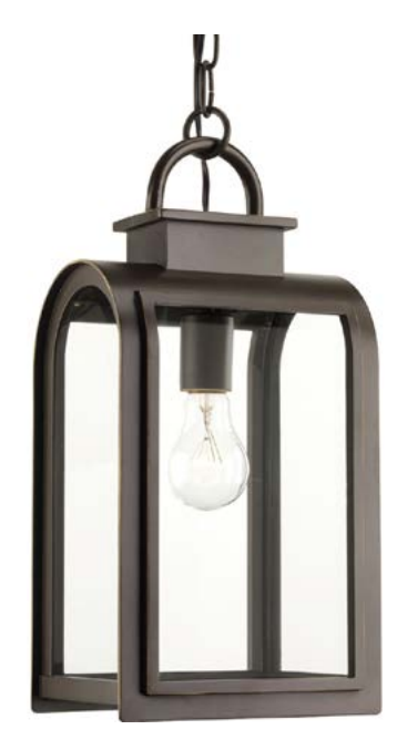
Diameter: 8" Height: 16" Overall ht. w/chain: 90-1/2"