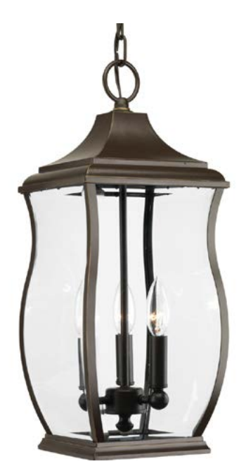
Diameter: 8" Height: 19-3/4" Overall ht. w/chain: 94"

Category: Outdoor Finish: Oil Rubbed Bronze (hand painted) Construction: Aluminum construction Glass: Clear Beveled glass panels