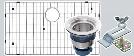
Grate, drain assembly and clips