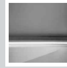
STAINLESS STEEL (MNO163219SR)