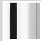
POLISHED CHROME (ML102CP)