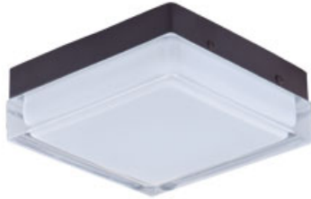
87644CLWTBZ Illuminaire LED Flush Mount