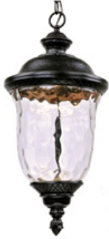
55427WGOB Carriage House LED Outdoor Hanging Lantern