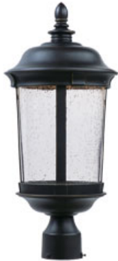
55021CDBZ Dover LED 3-Light Outdoor Post Lantern