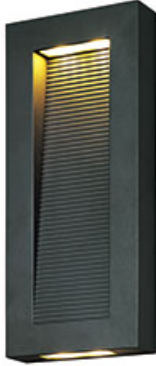
54352ABZ Avenue LED Outdoor Wall Lantern