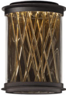
53497CLGBZFG Bedazzle LED Outdoor Wall Lantern