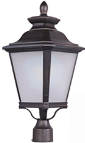
51121FSBZ Knoxville LED 1-Light Outdoor Pole/Post Lantern