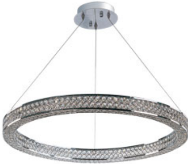
39773BCPC Eternity 3-Light Pendant