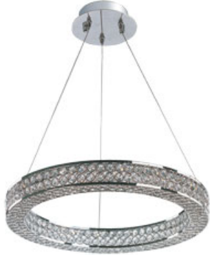
39772BCPC Eternity 3-Light Pendant