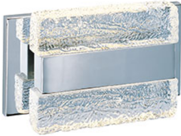
39621IBPC Ice 2-Light Bath Vanity