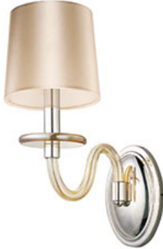
27541CGPN Venezia 1-Light Wall